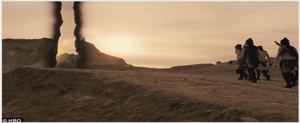
Hosts on the way to The Valley Beyond