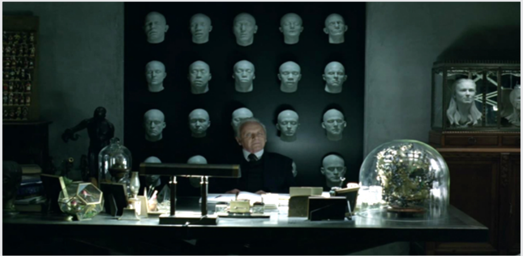
Robert Ford, played by Anthony Hopkins, appears as Supreme Being in The Westworld

Ford: Every piece of information in the world has been copied, backed up, except the human mind. The last analog device in the world (Les Escorches, S2, E7).